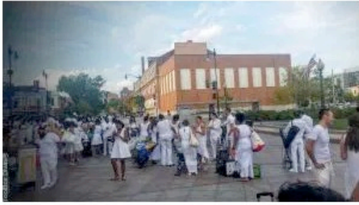
Diner En Blanc Washington DC. We gathered at the metro stations to travel together to the secret location.

Crisis averted. It was time to party. The table traveled well. Although it was made of wood, it wasn't heavy. I was able to assemble it within 3 to 5 minutes. Here are some pictures from the festivities.