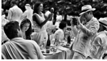
Picnic Le Blanc set for Saturday at Center Plaza 🇺🇸

Once guests are confirmed, participation becomes mandatory, regardless of weather conditions. (The event will take place rain or shine.)